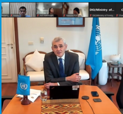
Closing Ceremony of the 2024 Frontier Tech Leader's Programme