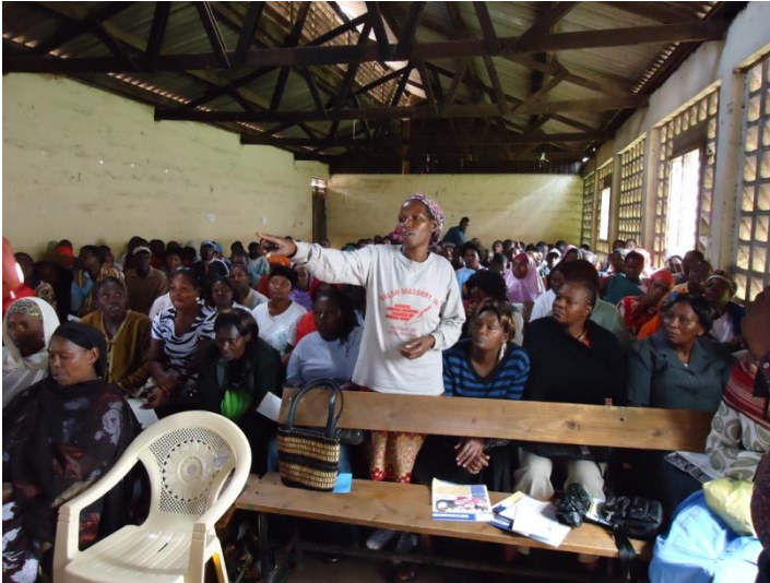
Voter education workshop Nairobi

Out of the 100 persons per province that COTP said attended its candidate workshops, 46 of these allegedly became candidates. However, basic data for this is not available, such as their names, what office they were seeking and how many of these won office. Anecdotally, the CBO from Western Province reported assisting seven candidates (all women and youth) of which two were successful. The CBO from Nyeri said one of the women out of their 100 was nominated as a County Representative. A call to that person showed that she had won office but attributed her success to the leadership training provided by the Kenyan Human Rights Commission. Although she remembered the COTP training, she said it was one of many and was only a day. She also added that women required additional training on issues such as self-esteem and that voter education could not be done in isolation of the rest of the needs for voters to be able to participate effectively.