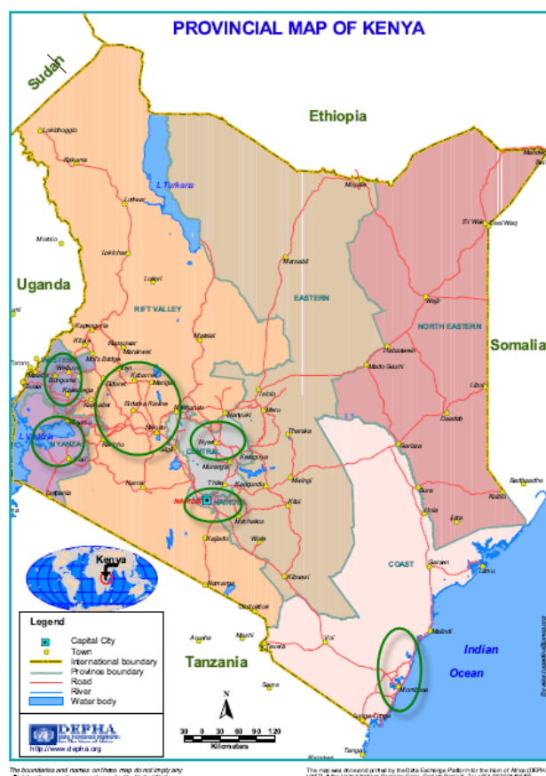
Figure 1: Map of Kenya with locations of intended project sites

The project intended to support 30 women candidates for National Assembly, six candidates with disabilities for special interest group seats in the National Assembly, and 10 women