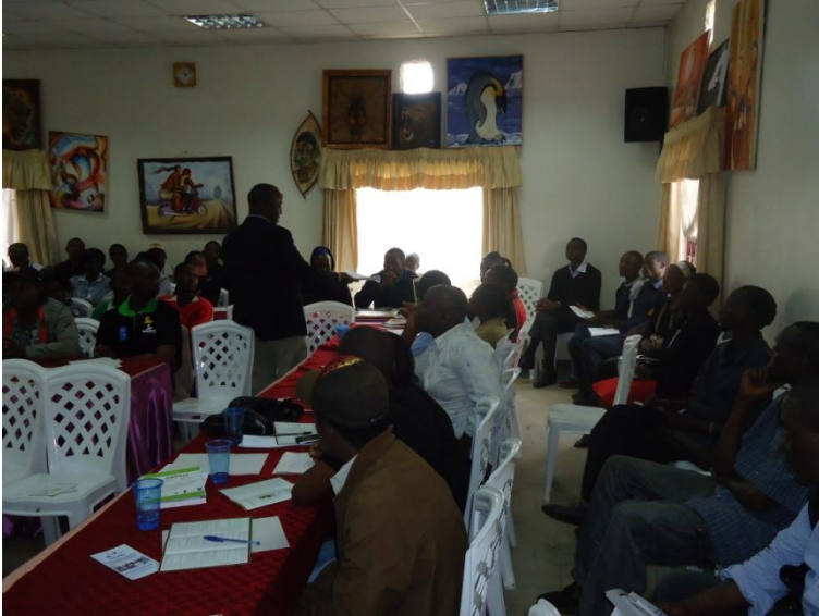
Figure 5: Participants in Nyeri workshop

The project was directly relevant to the interests of the COTP staff as it was with most civil society organizations in Kenya given the post-2007 electoral environment and the national efforts being made to have inclusive and peaceful elections in 2013. COTP had been providing capacity building support to CBOs since 1993. It did seem to be a nonpartisan organization, focused on its mission of helping the poor and marginalized, but also seemed to have limited experience in running development programs or in strengthening civic participation in the electoral processes. This affected the design of the project as noted, as well as its implementation, especially for something as specialized as candidate support.