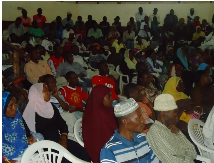
Voter education forum Coast

The project assumptions that the main constraint for the targeted groups were the lack of information on the constitution and the payment of nomination fees for those wanting to be candidates did not reflect the complexity of the issues or needs. Although these groups from grass-roots and marginalized areas were less likely to receive voter education messages, there was still a large-scale national effort done throughout Kenya by national and international organizations, and by the IEBC to inform the public on the new constitution for the referendum in 2010, for voter registration in 2010 and 2012, and in preparation for the 2013 elections with specific programs targeting the same beneficiary groups. With the exception of the IEBC, none of these efforts were taken into account in the design or implementation which affected its relevance in some cases. As an example, one of the participants in the candidate workshop said she had attended five workshops on the same topics and had difficulty at this point differentiating out the COTP one.