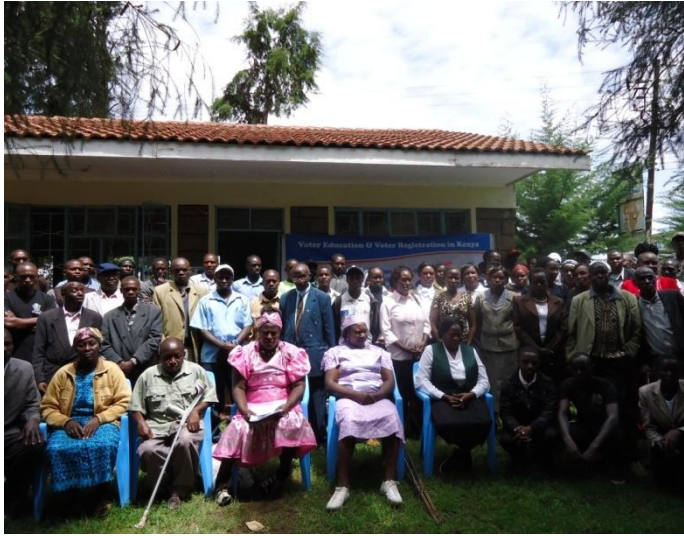
Voter education workshop Rift Valley

The efforts were one time activities and were not sustainable. Forums focused primarily on information sharing so the transfer of skills and knowledge beyond this was likely limited.