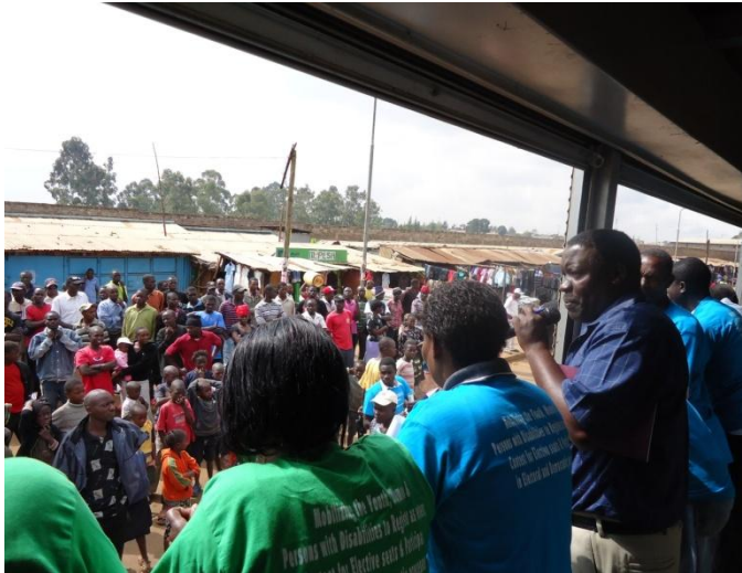
Road Show Nairobi

and would have reached some of the most poor and marginalized in the city. The CBO that participated in the Nairobi road show said they used volunteers as dancers to attract the crowd and pass messages and felt that though costly it was an effective effort.