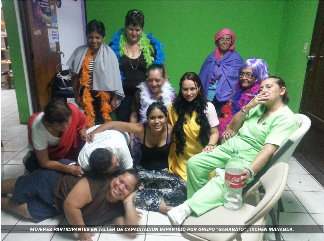
Women participating in a capacity-building workshop conducted by the “Garabato” group, Ixchen Managua.

and the added value generated by them. This exercise should show how (a) the use of theatre as a tool to promote grass-roots organization processes; (b) the use of a highly participative methodological approach and (c) processes of capacity-building bases on specific topics raised by the participants themselves were linked up. In order to ensure that the methodology to systematize experiences sharing echoes and disseminates widely at the groups and individual levels, it would be important to select the most appropriate means to display them while taking into consideration the specificities of the different contexts, including the cultural dimension. (See conclusions v and vi).