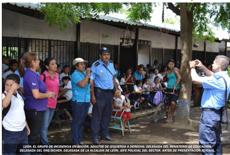
León, the Advocacy Group in action. Before a theatre performance.

The project's National Coordination Team was made up of an Executive Team (two artistic directors, a methodological expert and one administrator, who were all permanent MOVITEP-FS staff) 13 ; and of the Coordinators of the 13 theatre groups in the various locations of the intervention. The National Coordination Team carried out periodical meetings in order to supervise and adjust the planning and the implementation of the activities (two days/once a month). The Executive Team met at least once a month or more often when the need arose. The project also established collaborative relationships with about twenty women's rights organizations working on the topics of domestic violence in the various locations.