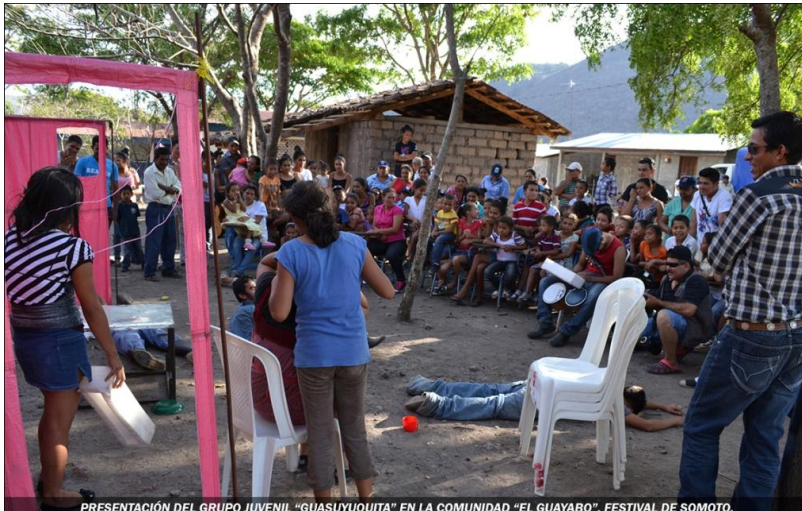
Performance by the youth group "Guasuyuquita" in the community of El Guayabo, Festival of Somoto

This legal set-back revitalized the work being done by women's organizations who for decades now have been conducting advocacy work to prevent gender-based violence and push for an improvement in legislation surrounding human rights. As a result of this process, the national assembly adopted in February 2012 Law 779, the "Law on violence against women" and a reform of law 641 in the penal code which represents the specific normative corpus dealing with the protection, reparation and sanction of all forms of gender-based violence. The entry into force of this law has provoked a strong debate throughout all of Nicaraguan society with some strong resistance coming from conservative and religious sectors which hold a lot of power in the national political landscape. Women's organizations considered this law to be a considerable advance, until it was reformed by presidential decree (decree no. 42 – regulating Law 779) 7 , introducing the concept of mediation as an