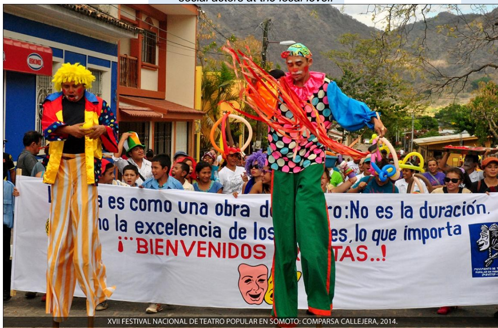
XVII National Festival of Popular Theatre in Somoto: Street performance, 2014