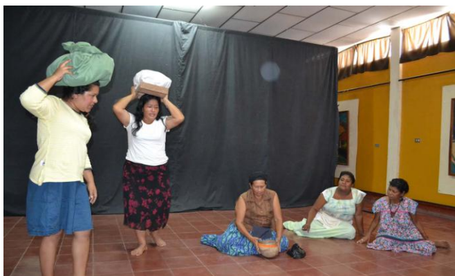
Mystical women of the “Lapta Yula” theatre group of Bilwi, Caribbean Coast during the Estelí Festival

possibility of jointly constructing the production and performance of theatre plays based on their own experiences allowed them to positively integrate the messages they had worked on. However, in some cases there existed the risk that the content and language of the performances suggested by the group focused too strongly on negative and violent experiences. By including more positive messages about masculinity in the performance elaboration process it was possible to show that “other