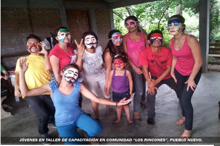
Young people in capacity-building workshop in the community of “Los Rincones”, Pueblo Nuevo.

The UNDEF project provided the opportunity to show how art and popular theatre can be used to promote organizational processes, mainly with women and young people, in suburban and rural areas. The added value provided by this project contributed to promoting this innovative approach and to strengthening the institutional capacity and presence of MOVITEP-FS in the ten municipalities of intervention, including on the Atlantic coast where indigenous populations live. Furthermore, the benefit provided by the developed initiatives enabled learning experiences as well as alliances and collaboration between social actors at the local level. Thirteen theatre groups were able to strengthen their relationship with women’s organizations working in the field of domestic violence and with youth groups, Local Advocacy Groups and local authorities dealing with this issue. All of this allowed for the reinforcement of collective awareness-raising spaces with a commitment to improving the status of women with regards to their rights in Nicaraguan society and increasing knowledge of the applicable law (Law 779).