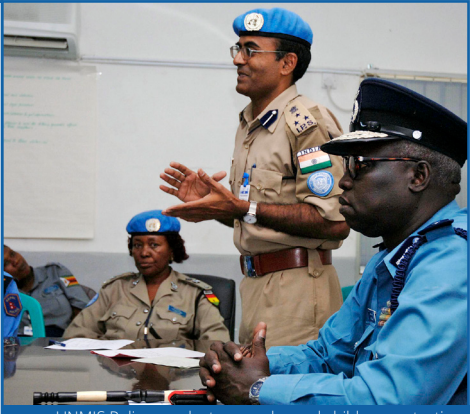
UNMIS Police conducts a gender and children protection sensitization workshop with senior police officers from Bahr el Jabal State, Juba.

The GFP committed catalytic seed-funding to the transitional government's efforts to address existing rule of law, justice, security and human rights challenges. This was done to: strengthen the legislative, policy and coordination capacities of the judicial bodies; empower communities to access their rights; enhance the ability of civil society to advocate for gender-sensitive and human-rights based reforms; and, increase capacity of rule of law institutions. UNDP, UNITAMS and GFP partners on the ground are working jointly to support the Ministry of Justice, the Attorney-General's office, the judiciary, academics and the bar association, among others.