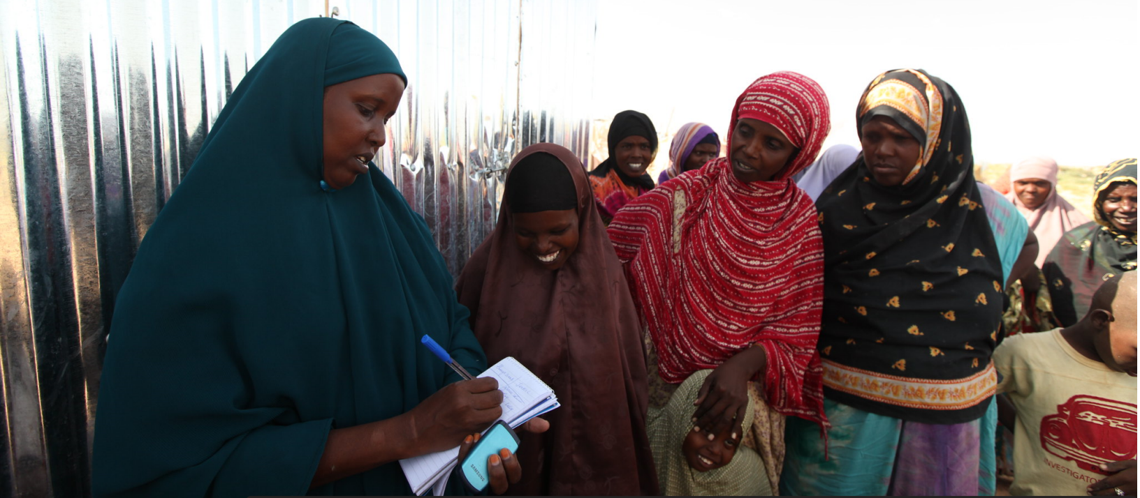
UNDP Somalia | Paralegal provides legal assistance to IDPs in Ajuran IDP camp, Garuwe