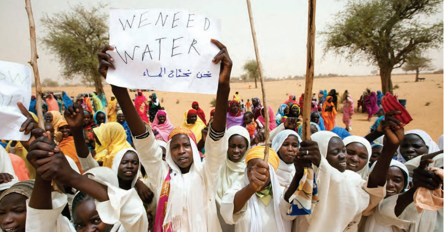
Residents of Forog, North Darfur protest a serious shortage of water.