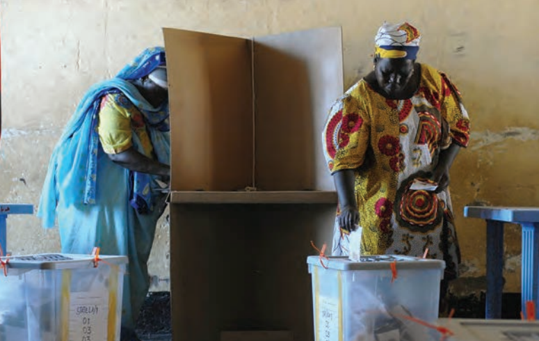
Women in Juba, Sudan, vote in their country's national elections, the first to take place in almost 25 years. Originally set for 11 to 13 April, the date to vote has been extended by an additional two days.

to counteract pressure to follow family voting patterns. Ensuring that national, regional and international election observers understand that family voting is illegal and can recognize and document it should be a critical part of election observer training. Observers should also have checklists to understand possible gender gaps in election processes. OSCE has prepared a comprehensive Handbook for Monitoring Women's Participation in elections with a checklist for its election observers. 15 The checklist can be easily adapted for different contexts.