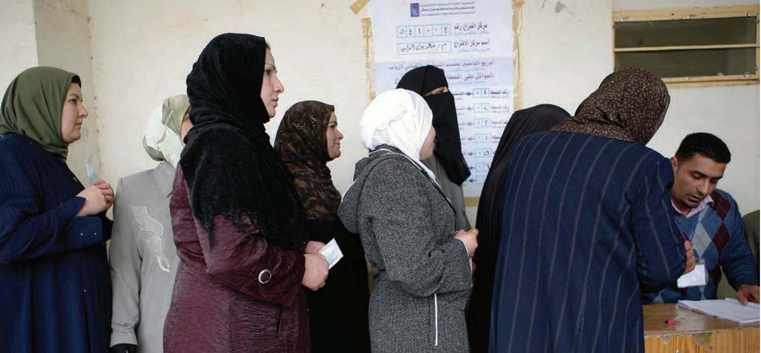
Iraqi women voters stand in line, waiting to enter a polling station.

Deal for Engagement in Fragile States 8 both identify five strategic priorities in post-conflict contexts. These priority areas largely overlap and other discussion papers or guidance notes in the UN Women Sourcebook on Women, Peace and Security, Peace and Security deal with the security, justice and conflict resolution