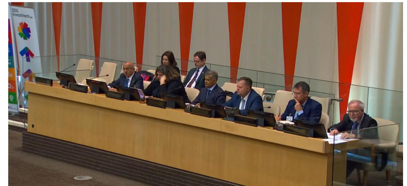
Opening of the 8th SDG Investment Fair

As part of this initiative, the GISD Alliance is developing integrated guidance for governments and investors interested in future issuances of sovereign SDG bonds. The guidance will consolidate lessons learnt and best practices emerging from bonds issued to date with a view to mobilizing longer-term finance for the SDGs.