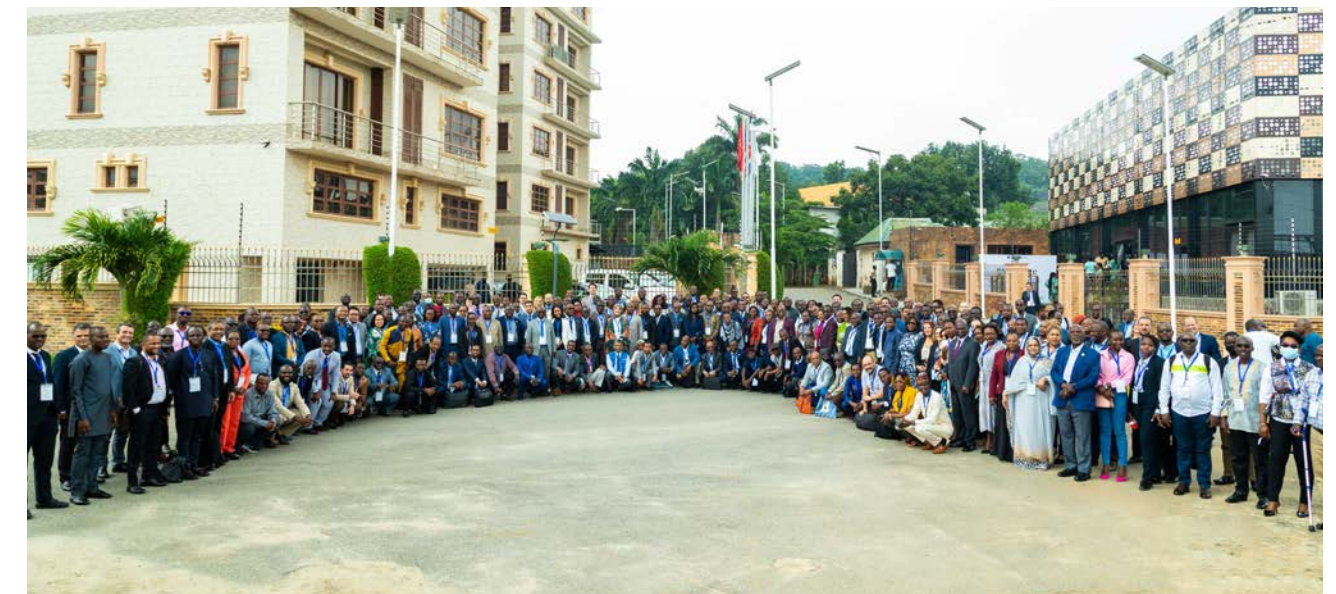
Participants of INFF workshop in Abuja, Nigeria, September 2022

UN DESA has further stepped up its support in this area, launching two flagship e-learning courses on INFFs during the 2023 ECOSOC Financing for Development Forum in April, and providing capacity support to selected countries. For example, UN DESA co-organized a four-day workshop on INFFs in Abuja, Nigeria, in September 2022, bringing together over 300 participants from 52 African countries, facilitating significant progress towards building an INFF community of practice in the region.