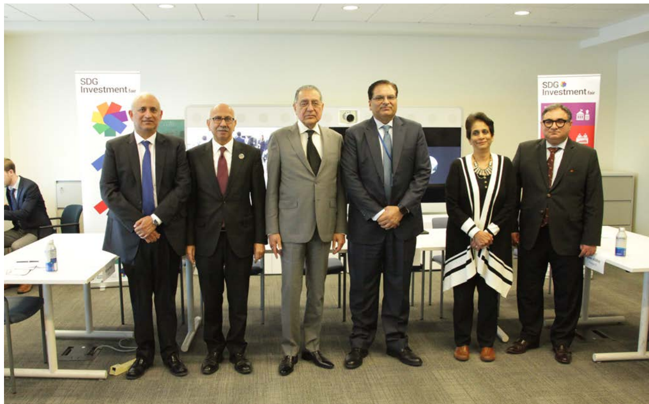
Pakistan launched over $2.4 billion in new initiatives on climate finance at the 8th SDG Investment Fair

At the 8th SDG Investment Fair in April 2023, several commercial banks, investment funds, and development finance institutions discussed solutions that could support investment risk sharing in vulnerable countries. A dozen projects and programmes were showcased, representing $6 billion in deal flow. The Ethiopian Investment Holdings Co. and Mauritanian Investment Promotion Agency highlighted key projects in sustainable agriculture and infrastructure. Eswatini also featured prominently, with active participation from its Minister of Finance.