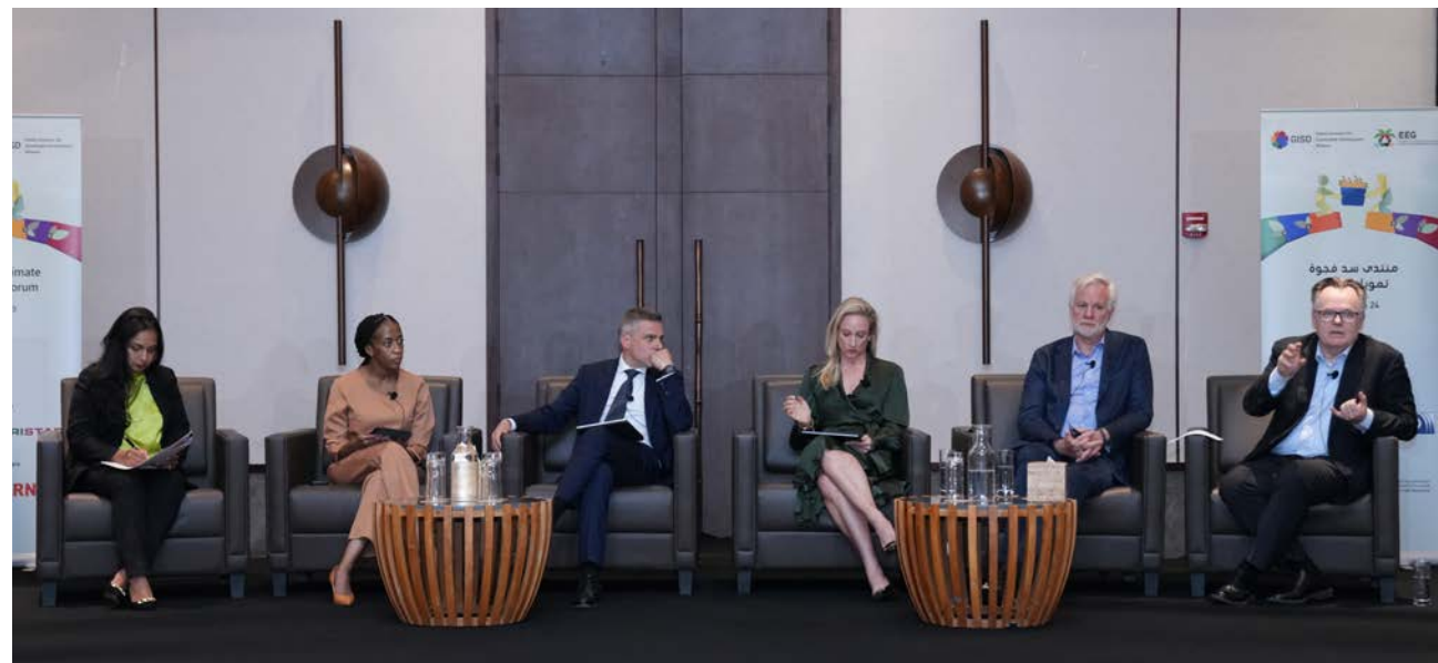
GISD Alliance discusses SDG Investing with the private sector in Western Asia

members underscored the importance of quality data on investment opportunities in developing countries.