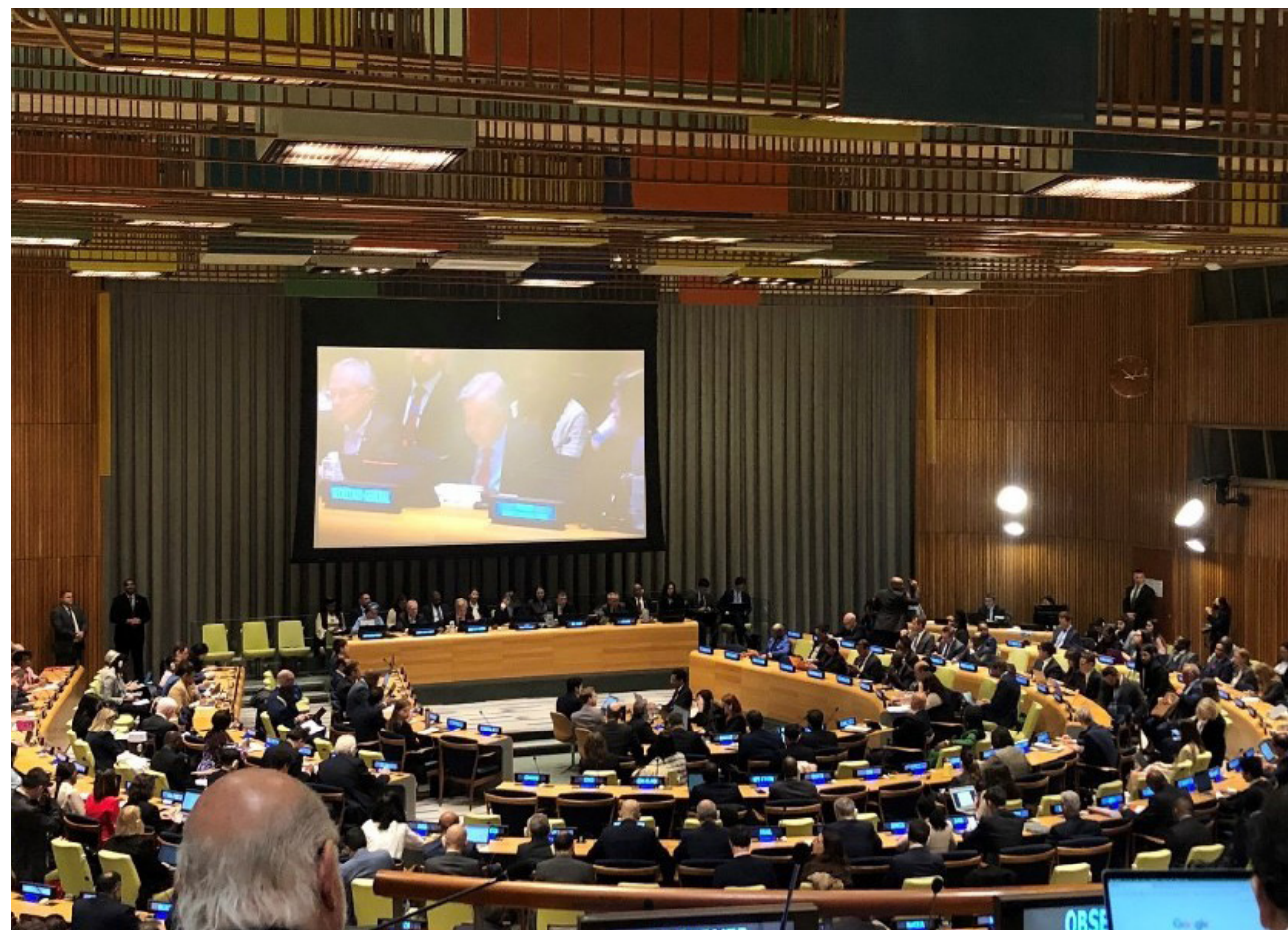
Secretary-General of the UN delivers opening remarks at the 2023 Financing for Development Forum

UN DESA spearheaded the analytical work to inform the Secretary-General's advocacy for an SDG Stimulus and ambitious reform of the international financial architecture. This analysis built on the 2022 Financing for Sustainable Development Report, which identified a 'great finance divide' that prevents many developing countries to raise sufficient