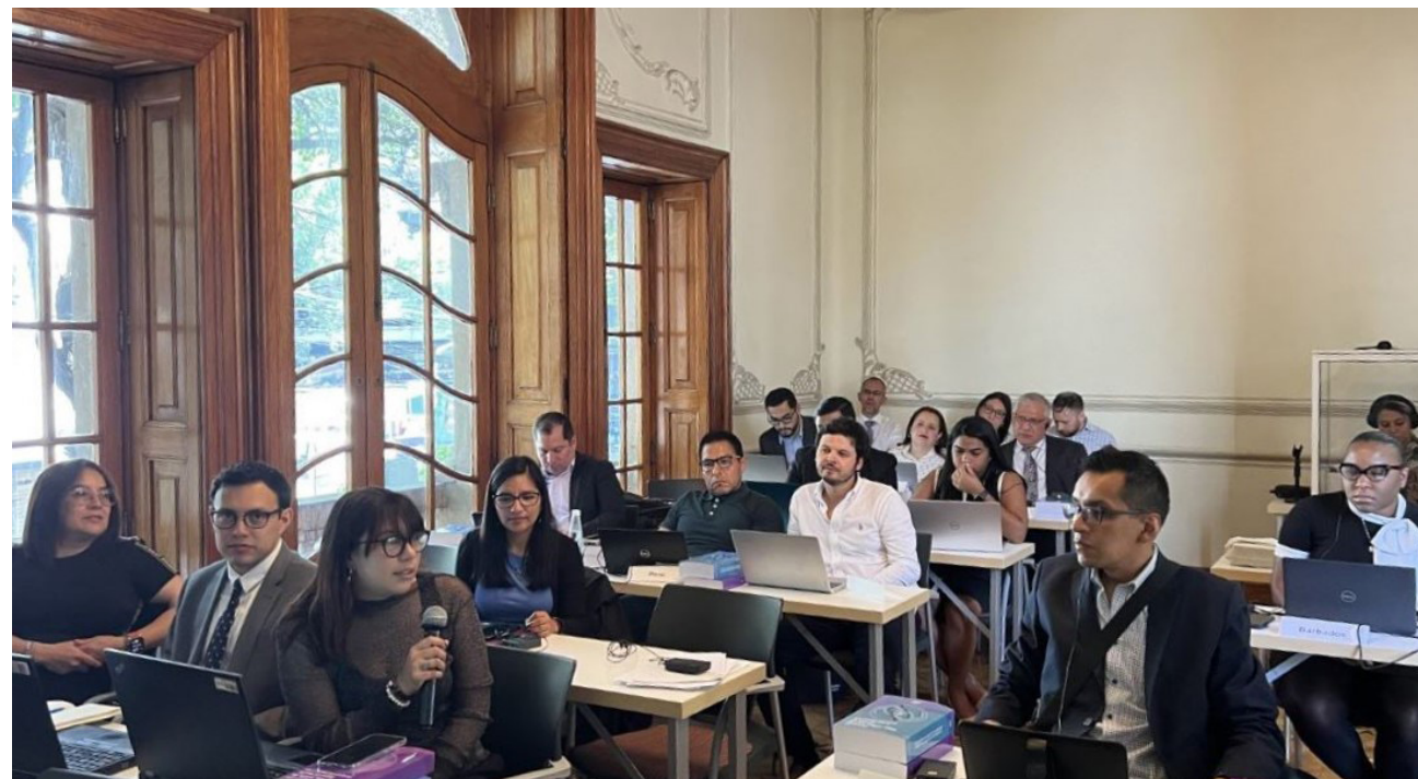
Active participation during the UN Workshop on Services in Mexico

includes a number of provisions relating to services that preserve Market State taxing rights – the domestic law taxing rights of the place to which the services are provided – more than under most other Models.