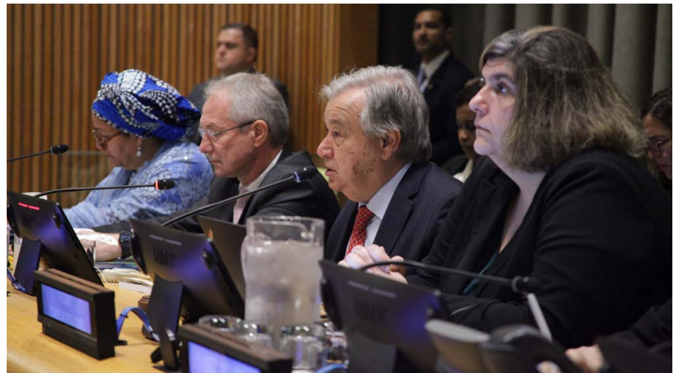
2023 Financing for Development Forum

UN DESA supported the 2023 ECOSOC Forum on Financing for Development follow-up, held in April 2023, which featured high-level political engagement to address pressing issues across all areas of the Addis Ababa Action Agenda. The outcome document of the 2023 Forum, adopted by consensus, advanced priorities in key areas, including the Secretary-General's proposal for an SDG Stimulus. The outcome served as an important step forward to address the intertwined crises affecting developing countries. It advances issues that require political momentum at the highest level and will feed into the overall follow up and review of the implementation of the 2030 Agenda for Sustainable Development at the High-level Political Forum in July 2023 as well as the SDG Summit and the