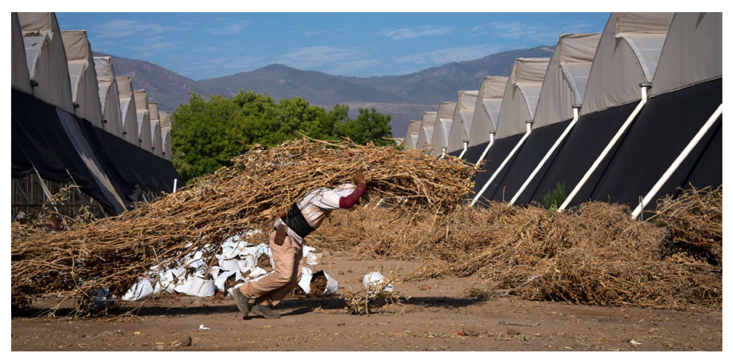
Heat stress impacts agricultural workers in Jalisco, Mexico. April 2024.

of passive cooling, higher energy efficiency and fast phasedown of climate-warming refrigerants offers the opportunity to reduce emissions from the cooling sector while protecting an additional 3.5 billion people at risk from heat by 2050.<sup>8</sup>