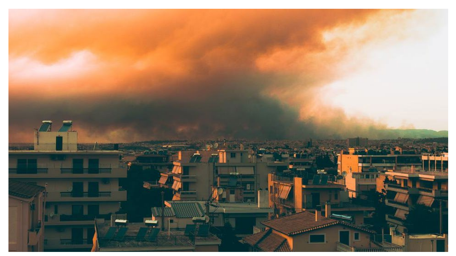
Athens is among many cities suffering extreme heat. High temperatures and strong winds caused wildfires in Greece in 2023.

(IPCC AR6). Even for future pathways with very low emissions, the world will see significantly hotter and more dangerous temperatures than today. As warming accelerates, some regions of the world will become uninhabitable as temperatures exceed the physiological limits of human liveability and survivability by the end of this century. According to the IPCC, there is "high confidence" that Central and South America, southern Europe, Southern and Southeast Asia, and Africa will be the most affected by climate change in terms of heatrelated mortality by 2100, based on 1.5°C, 2°C and 3°C increases in the global temperature. The IPCC projects that peak temperatures in heatwaves will increase significantly faster than global mean and local average temperatures. An extreme-heat event that would have occurred once in 50 years in a climate without human influence is now nearly five times more likely. Such an event is projected to be nearly 9 times more likely under 1.5°C and 14 times more likely under 2°C and bring heat and humidity levels that are far more dangerous.<sup>16</sup> 🐵