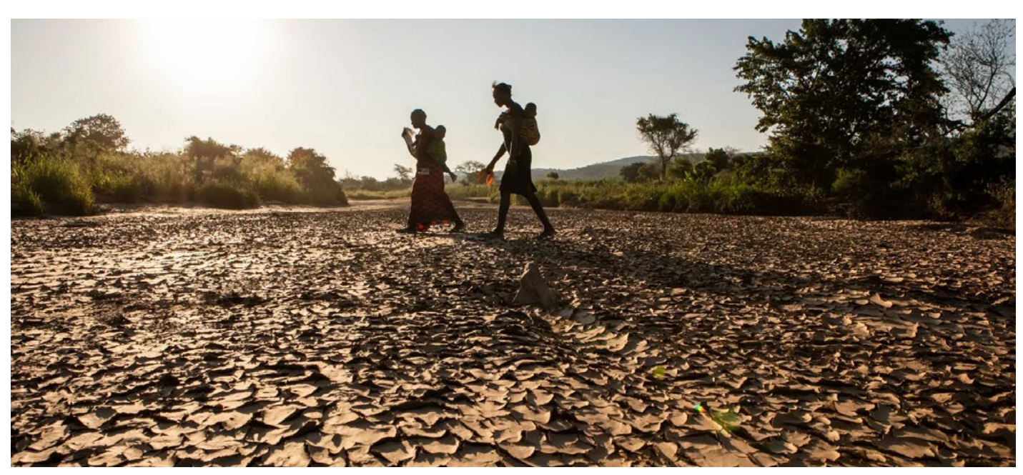
Extreme heat in East and Southern Africa has amplified the risk and impacts of drought. Drought conditions in Zambia have led to crop failure, impacting people's health.

to cooling. <sup>60</sup> To deliver these benefits, Governments must introduce joined-up approaches to policies that back action in all three areas. Governments have already signalled their commitment to do so through the Global Cooling Pledge at COP28.<sup>61</sup> There is need for much more research and development on cooling alternatives and cooling science overall.