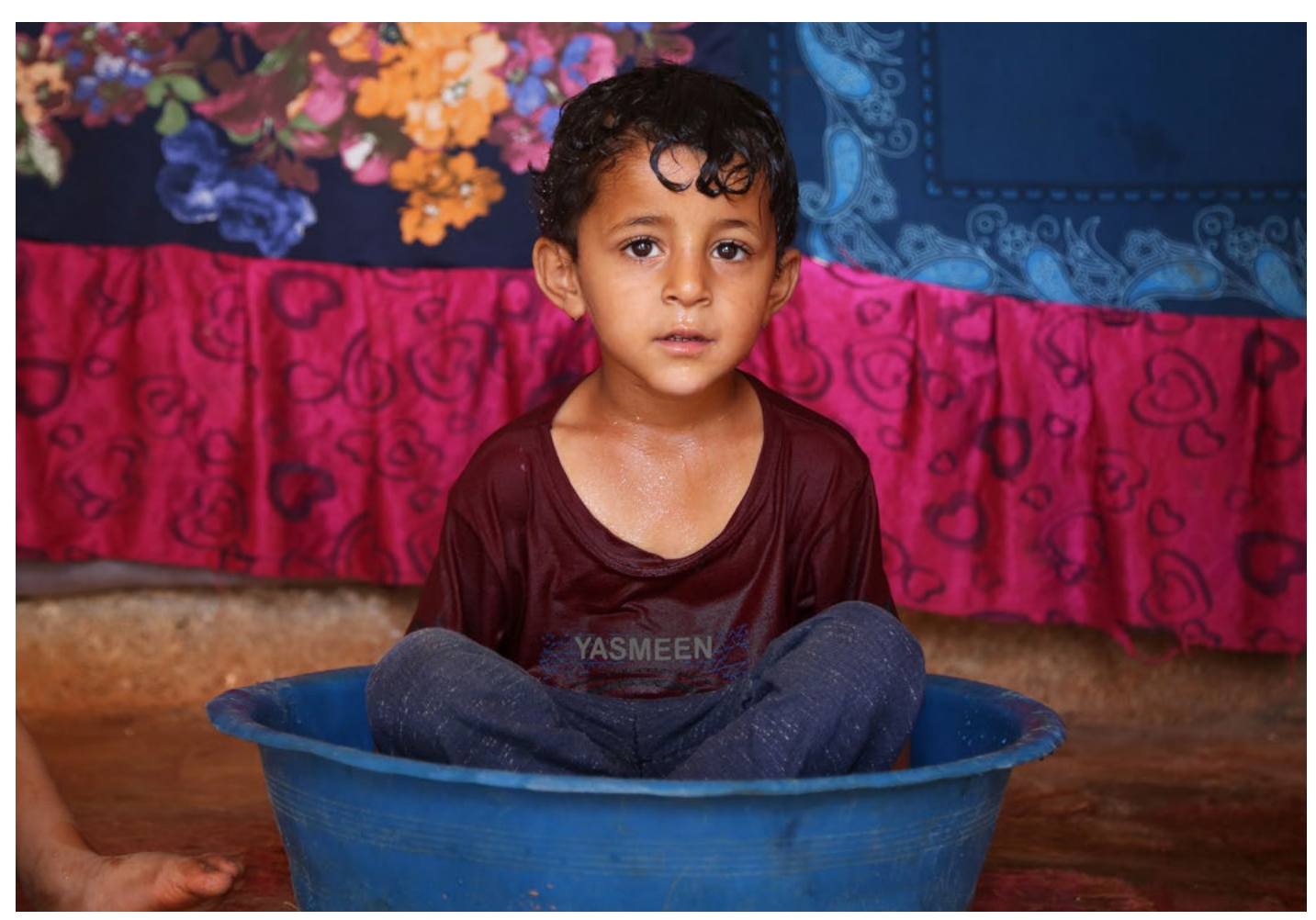
A child sits in a tub of water to beat the heat in Al-Hamra camp for internally displaced people in Syria's Idleb governorate.

diabetes and gestational hypertension if exposed to extreme heat, as well as hospitalizations.<sup>31</sup> In utero exposure to heat is more likely to result in stillbirth, low birthweight, and preterm birth.<sup>32</sup> Extreme heat further increases the risk of gender-based violence.<sup>33</sup>