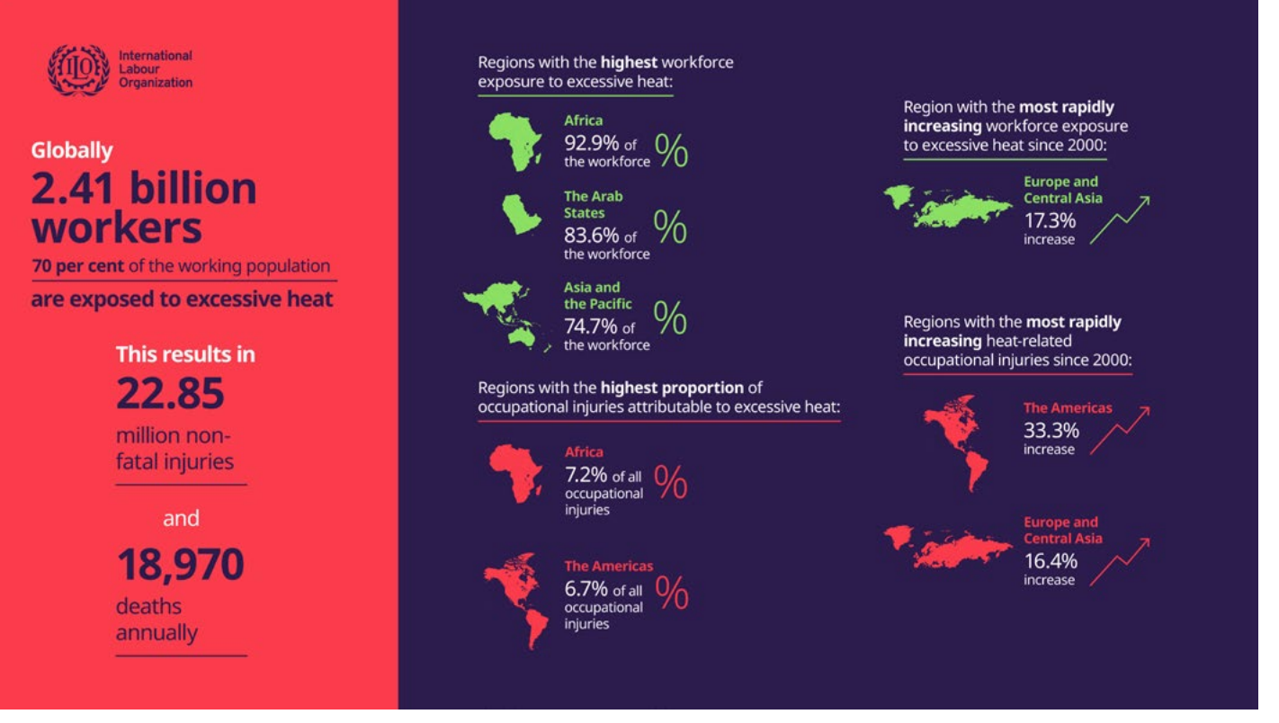
Source: ILO. 2024. Heat at work: Implications for safety and health. Geneva: ILO.

prepared. In response to this growing crisis, the Secretary-General is issuing a global call to action on extreme heat in four critical areas: Care for the vulnerable; protect workers; boost the resilience of our economies and societies using data and science, and limit temperature rise to 1.5°C. Extreme heat impacts virtually everything we do, and every aspect of our lives. The health and well-being of humans and ecosystems are in immediate peril. Economic growth is reduced, labour productivity diminished, water supplies exhausted, energy demand increased, precious crops decimated, school days missed, key infrastructure degraded and homes made uninhabitable, all of which puts more pressure on already-stretched public services and may overwhelm humanitarian assistance, essentially putting multiple Sustainable Development Goals (SDGs) at risk.